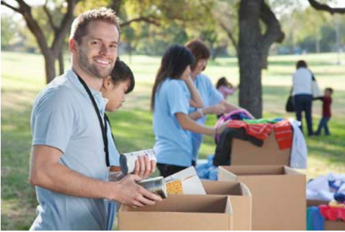
Resurrection parishioners assisting our Food and Clothing bank this past spring with distribution