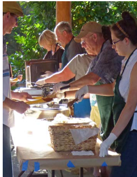
Parish Community Picnic