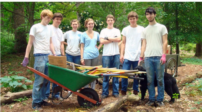
Youth Mission Trekkers helping to build nature path