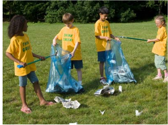
Middle School Youth Cleaning up Hillside Park