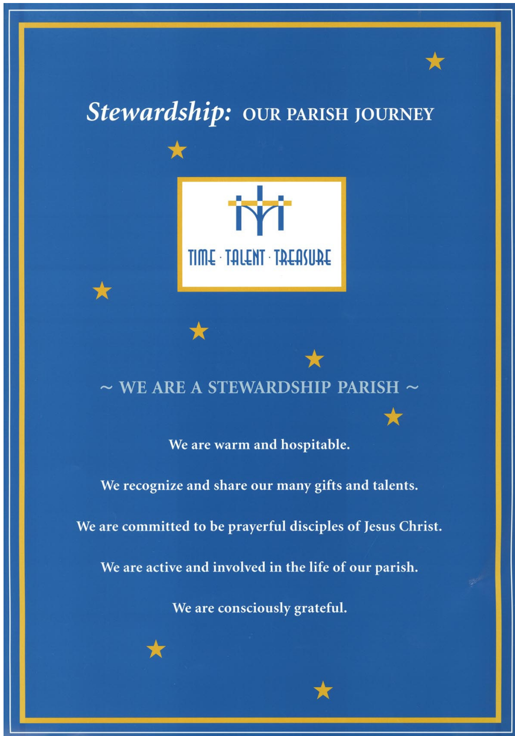
Exhibit E: Our Parish Journey Stewardship Poster

A “Stewardship Parish,” your parish is warm and hospitable with parishioners who recognize and share their many gifts and talents. Active and involved in the life of their parish, your parishioners are consciously grateful and committed to be prayerful disciples of Jesus Christ. In order to promote stewardship as “A Way of Life” in your parish community, the Office of Stewardship & Development is pleased to provide you with this “Our Parish Journey Stewardship Poster” free of charge. We suggest displaying this poster in appropriate locations in the church and parish center. Please refer to Exhibit F below.