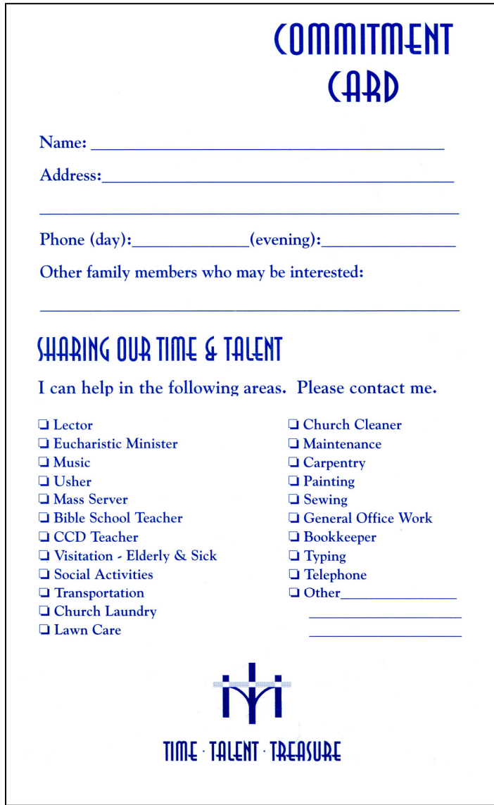
Exhibit S: Sample Stewardship of Time and Talent Commitment Card

As an alternative to organizing and planning an annual Ministry Fair, your parish may opt to utilize a Stewardship of Time and Talent Commitment Card. This commitment card can be completed by parishioners at Mass on your Stewardship Commitment Weekend. The Office of Stewardship & Development will be pleased to provide your parish with a Time and Talent Commitment Card free of charge (a treasure commitment card is also available). Your parish's Stewardship Committee may prefer to design their own commitment card for parishioners. Please refer to Exhibit S below.