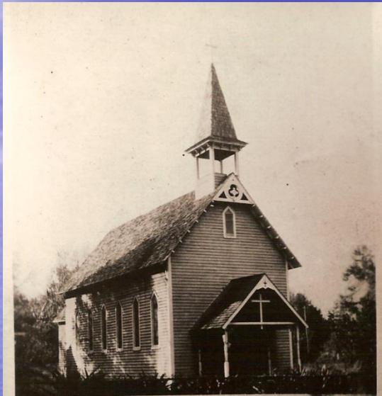
St. Philip Neri-1889