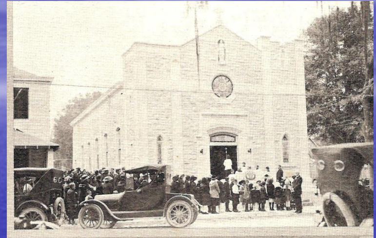
Blessed Trinity Church- 1930