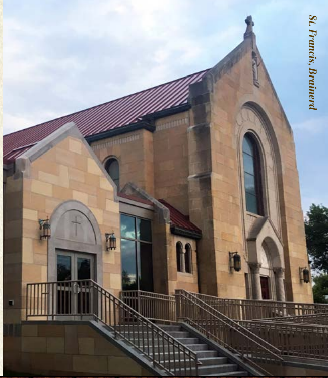
St. Francis, Brainerd

"Having participated in many Diocesan opportunities allowing me to focus on my spiritual growth, I continue to support UCA."