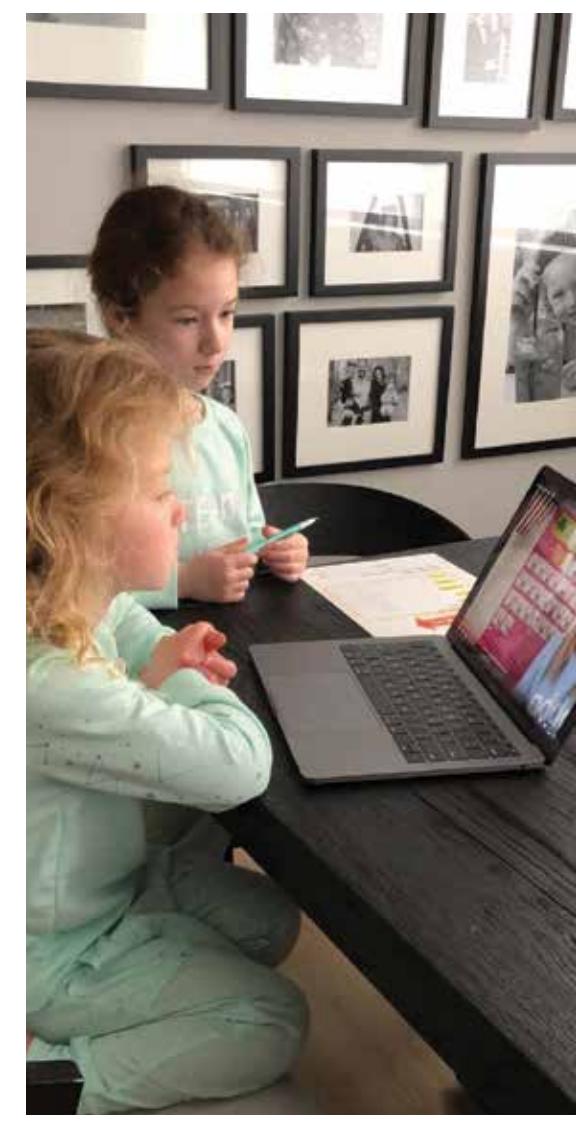
Young students embracing home learning with a video call.

Qualified charitable distributions are still a great way if you are 70½ or older to make contributions. If you are 70½ or older, a qualified charitable distribution ("QCD" or "IRA charitable rollover") allows you to make a tax-free gift of any amount up to $100,000 per year to the Catholic Education Foundation directly from your IRA.