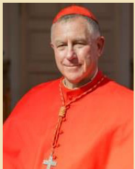
Sunday Plenary Speaker Cardinal John Dew, D.D. Archbishop of Wellington, New Zealand