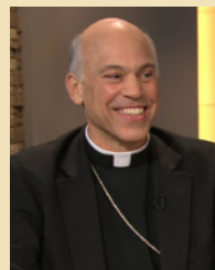
Most Reverend Salvatore Cordileone Archbishop of San Francisco