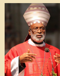
Most Reverend Charles Palmer-Buckle Archbishop of Accra, Ghana Vice President, Caritas International