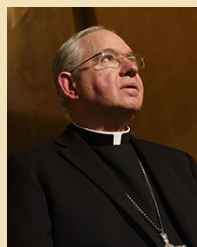
Most Reverend Jose Gomez Archbishop of Los Angeles President, United States Conference of Catholic Bishops