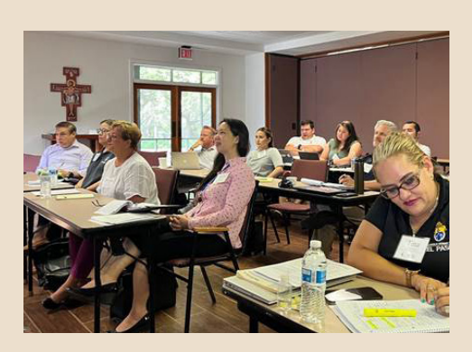
ICSC Regional Meetings

On the weekend before the annual ICSC conference takes place, the ICSC Committee on Catholic Foundations hosts a Forum that offers networking and interactive discussions on the latest trends and current issues facing Catholic foundations. Facilitated by experts in various foundation-related fields, the Forum for Catholic Foundations is designed for foundation directors, officers, staff, foundation board members and interested diocesan professionals.