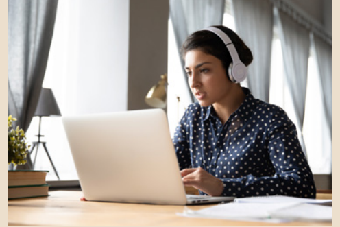
OSV-ICSC Diocesan Development Webinars

Members have an opportunity to network digitally and gather regionally with colleagues from nearby dioceses and archdioceses.