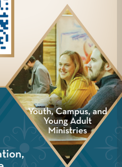
Youth, Campus, and Young Adult Ministries

For more information, please call the Bishop's Lenten Appeal office at 703-841-2570 or visit our website at