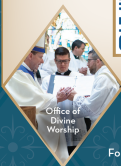
Office of Divine Worship