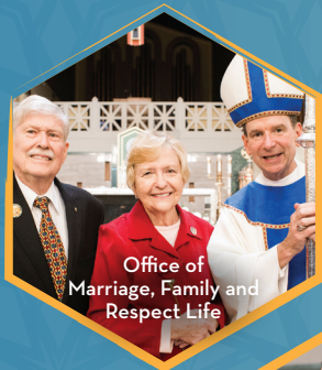
Office of Marriage, Family and Respect Life