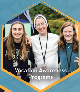
Vocation Awareness Programs