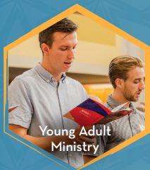
Young Adult Ministry