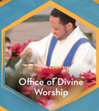
Office of Divine Worship