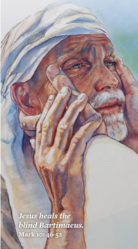
Jesus heals the blind Bartimæus. Mark 10: 46-52