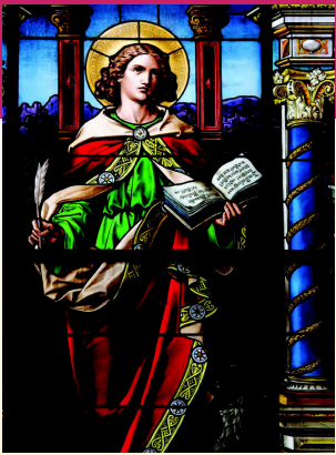
The Society of St. John the Evangelist $500-$999

The Church grew and flourished because of the special role St. John played in making the Good News of Jesus known throughout the world through his writings. When you give to the Annual Diocesan Appeal by making a gift as a member of the Society of St. John, you, too, make an incredible impact on the Church and making the message of Jesus known throughout our Diocese and world.