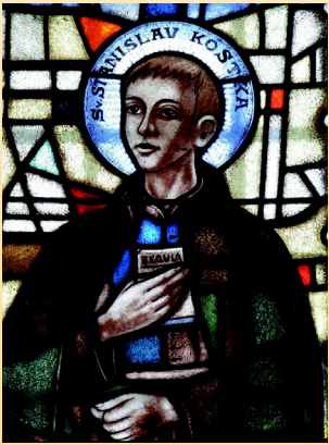
The Society of St. Stanislaus $5,000-$9,999

St. Alice understood what it was like to live a life of much suffering, but through it all she was generous in giving God's love to all those she encountered. Like St. Alice, your generosity to the Annual Diocesan Appeal as a member of the Society of St. Alice brings the hope of Christ to so many in our Diocese who are suffering, experiencing brokenness and feeling forgotten.