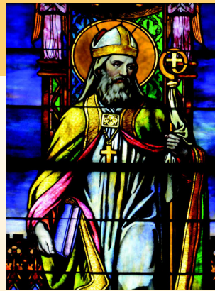
The Society of San Patricio $1,000-$1,499

The Church grew and flourished because of the special role St. John played in making the Good News of Jesus known throughout the world through his writings. When you give to the Annual Diocesan Appeal by making a gift as a member of the Society of St. John, you, too, make an incredible impact on the Church and making the message of Jesus known throughout our Diocese and world.