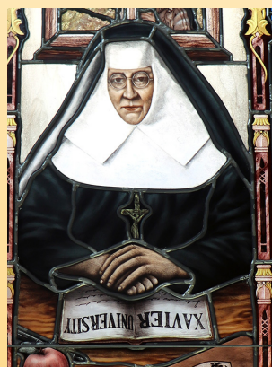
The Society St. Katharine Drexel $10,000-$24,999

St. Stanislaus was so devoted to the faith that he gave his life for love of Jesus when he was martyred for celebrating Mass. Your generosity to the Annual Diocesan Appeal as a member of the St. Stanislaus Society strengthens the celebration of and devotion to the Catholic faith throughout the 28 counties of the Diocese of Fort Worth, a cause for which St. Stanislaus was willing to lay down his life.