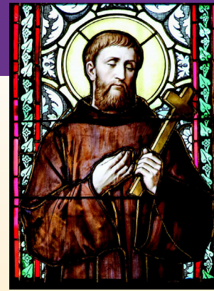
The Society of St. William $1,500-$2,499

St. Patrick devoted his life to spreading the Gospel throughout the entire countryside of Ireland to those most in need of spiritual nourishment. By making a gift to the Annual Diocesan Appeal as a member of the Society of San Patricio, your generosity brings much needed spiritual nourishment to more than one million Catholics in the Diocese of Fort Worth.