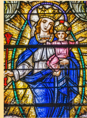
The Society of Our Lady of Victory $25,000-$49,999

St. Katharine Drexel left her life as an heiress behind when she became a nun. She used her inheritance in the founding of churches, schools and religious orders across minority communities in the United States. Through your generosity to the Annual Diocesan Appeal as a member of the Society of St. Katharine Drexel, you embrace the philanthropic vocation that sustains the Diocese of Fort Worth for future generations.