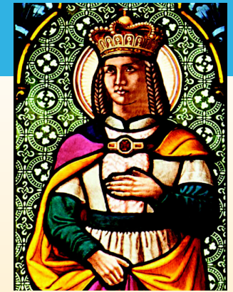
The Society of St. Alice $2,500-$4,999

The quiet and pious life of St. William reminds us that even the simplest acts of love for God can help us to grow in sainthood. Your generosity as a member of the Society of St. William reflects the love of God to all those reached by the funds of the Annual Diocesan Appeal, just as William's sainthood has reflected God's love to all people for centuries.