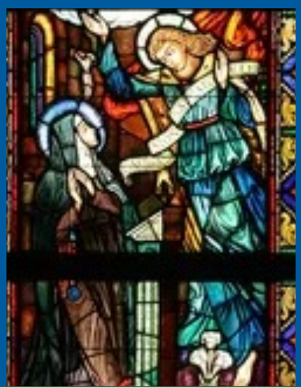
St. Juliana of Liege Circle

Having received visions of the moon in its full brilliance with a dark stripe across it, the Lord Jesus made it known to her the moon was a symbol of the life of the Church here on earth and the dark line was the absence of a liturgical feast in honor of the Eucharist. The feast was instituted years after her death and St. Juliana is credited by Pope Urban IV with bringing about the Feast of Corpus Christi.