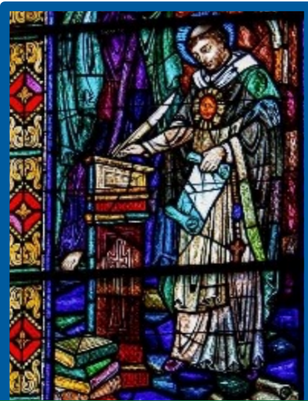
St. Thomas Aquinas Circle

In the Reformation of the sixteenth-century questions about the real presence of Jesus in the Eucharistic arose. St. Thomas Aquinas famously defended the thesis that the entire Christ is present in the sacrament of the Eucharist.