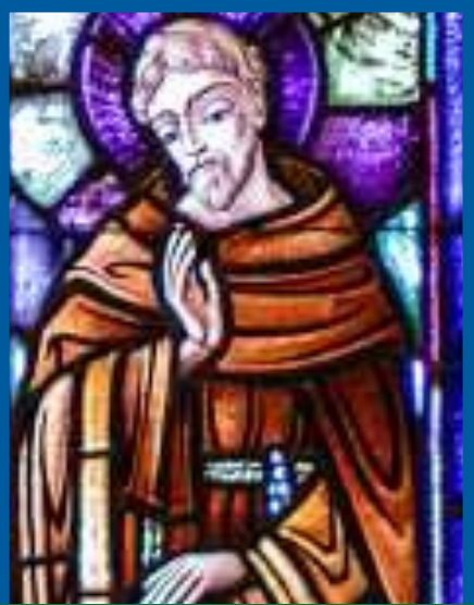
St. Francis of Assisi Circle

Humility is the heart of Franciscan spirituality. St. Francis showed, by word and by action, that only a humble and penitent spirit could be truly readied for a gift as important as the Body and Blood of Christ.