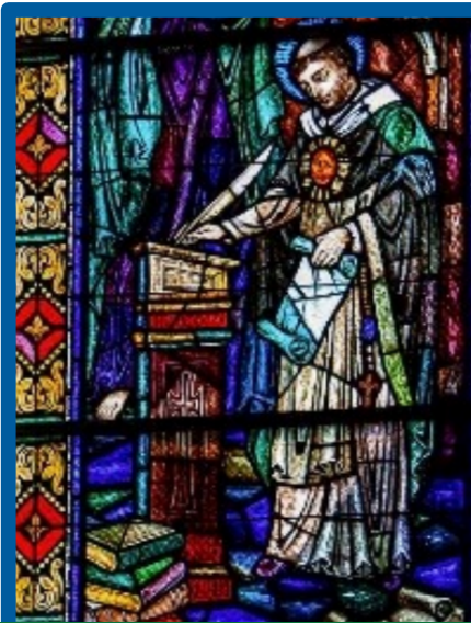
St. Thomas Aquinas Circle

In the Reformation of the sixteenth-century questions about the real presence of Jesus in the Eucharistic arose. St. Thomas Aquinas famously defended the thesis that the entire Christ is present in the sacrament of the Eucharist.