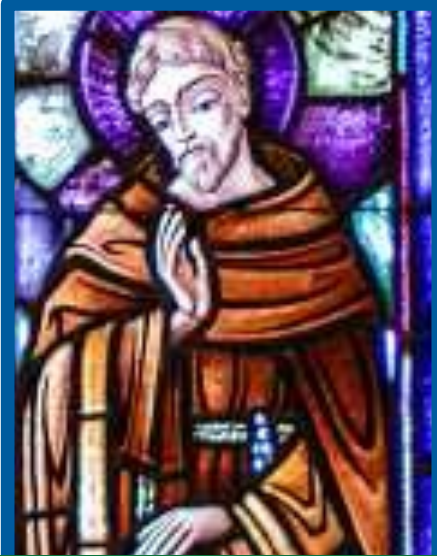
St. Francis of Assisi Circle

Humility is the heart of Franciscan spirituality. St. Francis showed, by word and by action, that only a humble and penitent spirit could be truly readied for a gift as important as the Body and Blood of Christ.