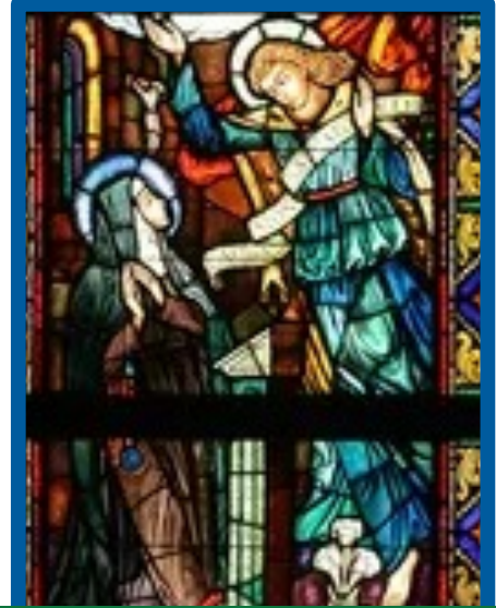
St. Juliana of Liege Circle

Having received visions of the moon in its full brilliance with a dark stripe across it, the Lord Jesus made it known to her the moon was a symbol of the life of the Church here on earth and the dark line was the absence of a liturgical feast in honor of the Eucharist. The feast was instituted years after her death and St. Juliana is credited by Pope Urban IV with bringing about the Feast of Corpus Christi.