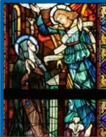
St. Juliana of Liege Circle

Having received visions of the moon in its full brilliance with a dark stripe across it, the Lord Jesus made it known to her the moon was a symbol of the life of the Church here on earth and the dark line was the absence of a liturgical feast in honor of the Eucharist. The feast was instituted years after her death and St. Juliana is credited by Pope Urban IV with bringing about the Feast of Corpus Christi.