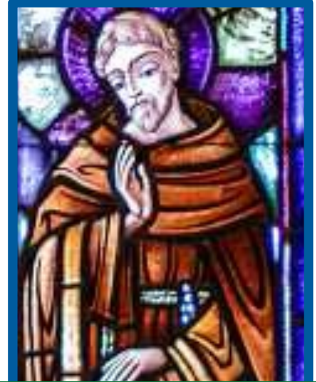
St. Francis of Assisi Circle

Humility is the heart of Franciscan spirituality. St. Francis showed, by word and by action, that only a humble and penitent spirit could be truly readied for a gift as important as the Body and Blood of Christ.