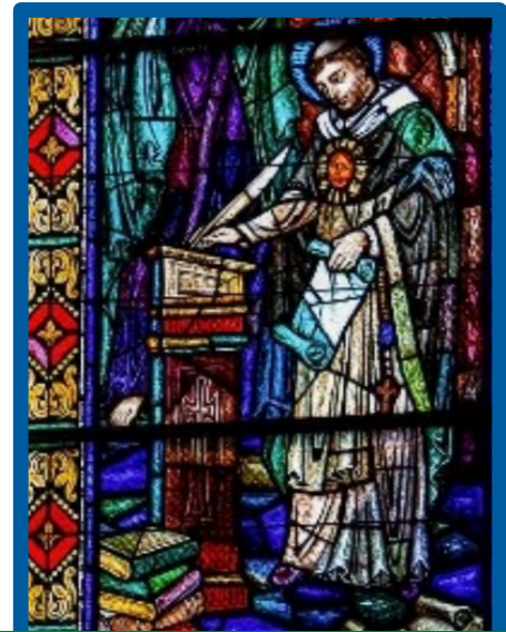
St. Thomas Aquinas Circle

In the Reformation of the sixteenth-century questions about the real presence of Jesus in the Eucharistic arose. St. Thomas Aquinas famously defended the thesis that the entire Christ is present in the sacrament of the Eucharist.