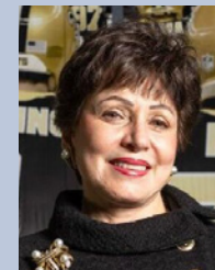
Gayle Benson Owner of the New Orleans Saints of the NFL and the New Orleans Pelicans of the NBA