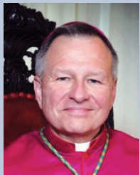
Most Reverend Gregory M. Aymond Archbishop of New Orleans