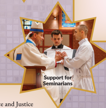
Support for Seminarians