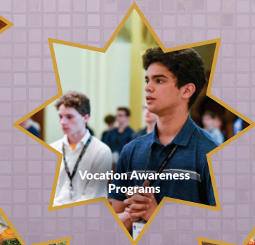
Vocation Awareness Programs