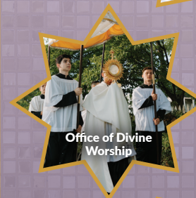
Office of Divine Worship