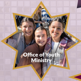
Office of Youth Ministry