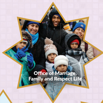
Office of Marriage, Family and Respect Life