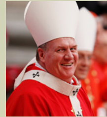
Cardinal Joseph W. Tobin, C.S.s.R. Archbishop of Newark